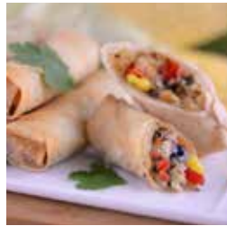
SOUTHWEST STYLE SPRING ROLL WITH CHICKEN

Seasoned Ground Beef and Cheddar Cheese wrapped in flaky Dough