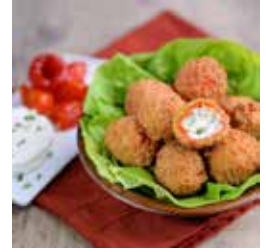
STUFFED PEPPADEW PEPPERS

Chicken, Onions, Peppers, Cheddar Cheese and Cilantro wrapped in flaky Dough