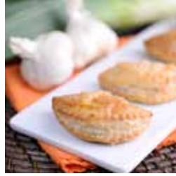
CHICKEN & LEEK IN PUFF PASTRY

Buffalo-Style Chicken, Celery, Carrots and Housemade Dressing wrapped in a Spring Roll Skin