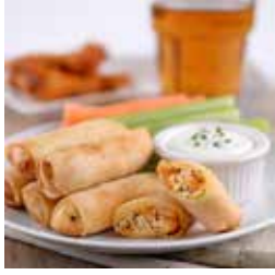
BUFFALO SPRING ROLL

Special Order items available within 5 - 7 days Offered through Buckhead Meat of Atlanta