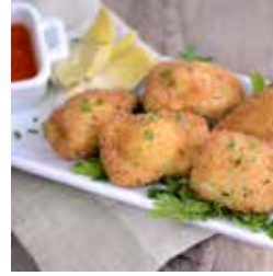
BOURSIN STUFFED ARTICHOKE

Smoked Chicken, Braised Leek, Garlic and Herb Boursin Cheese wrapped in flaky Puff Pastry