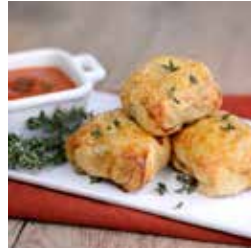
MINI CHICKEN WELLINGTON

Sautéed Peppers, Onions, Garlic, Herbs and a blend of Shredded Cheeses stuffed in a Tortilla Cornucopia