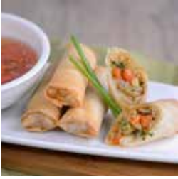
VEGETABLE SPRING ROLL

Special Order items available within 5 - 7 days Offered through Buckhead Meat of Atlanta