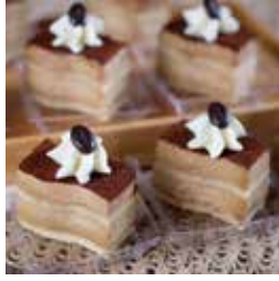
TIRAMISU MINI WAVE

Special Order items available within 5 - 7 days Offered through Buckhead Meat of Atlanta