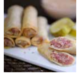
REUBEN SPRING ROLL

Hand-Breaded Artichoke stuffed with Boursin Cheese