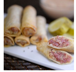
REUBEN SPRING ROLL

Hand-Breaded Artichoke stuffed with Boursin Cheese