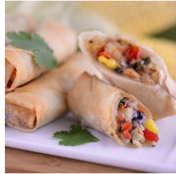
SOUTHWEST STYLE SPRING ROLL WITH CHICKEN

Seasoned Ground Beef and Cheddar Cheese wrapped in flaky Dough