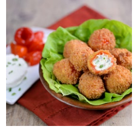
STUFFED PEPPADEW PEPPERS

Chicken, Onions, Peppers, Cheddar Cheese and Cilantro wrapped in flaky Dough