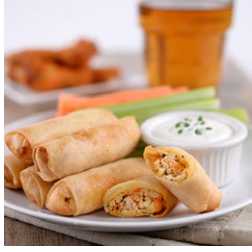
BUFFALO SPRING ROLL

Special Order items available within 5 - 7 days Offered through Buckhead Meat of Atlanta