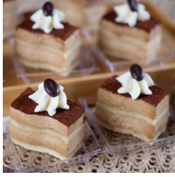
TIRAMISU MINI WAVE

Special Order items available within 5 - 7 days Offered through Buckhead Meat of Atlanta