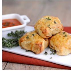
MINI CHICKEN WELLINGTON

Beef Tenderloin and Mushroom Duxelles wrapped in a flaky Puff Pastry