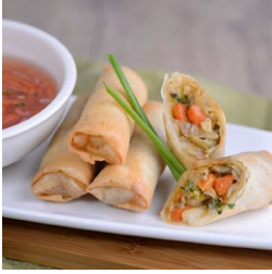
VEGETABLE SPRING ROLL

Special Order items available within 5 - 7 days Offered through Buckhead Meat of Atlanta