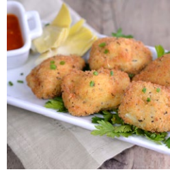
BOURSIN STUFFED ARTICHOKE

Smoked Chicken, Braised Leek, Garlic and Herb Boursin Cheese wrapped in flaky Puff Pastry