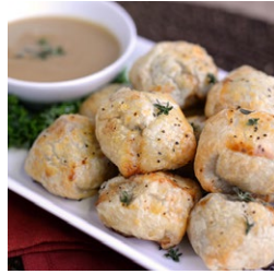
MINI BEEF WELLINGTON

Sautéed Peppers, Onions, Garlic, Herbs and a blend of Shredded Cheeses stuffed in a Tortilla Cornucopia