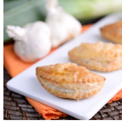
CHICKEN & LEEK IN PUFF PASTRY

Buffalo-Style Chicken, Celery, Carrots and Housemade Dressing wrapped in a Spring Roll Skin