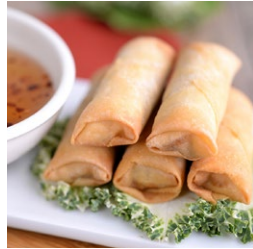
CHICKEN CASHEW SPRING ROLL

Chicken, Peppers, Black Beans, Sautéed Corn and Spices wrapped in a Spring Roll Skin