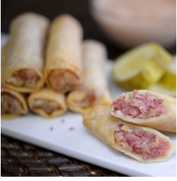
REUBEN SPRING ROLL

Stocked items are available on your next scheduled delivery