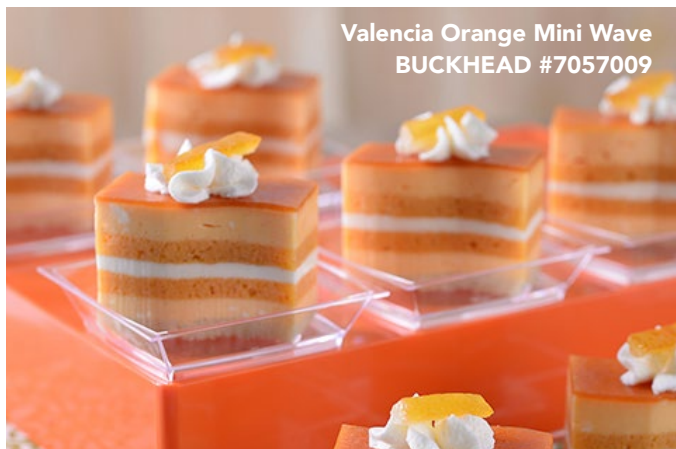
Valencia Orange Mini Wave BUCKHEAD #7057009

WE PROVIDE A CONVENIENT ALTERNATIVE FOR PROFESSIONAL CHEFS PREPARING LARGE-SCALE MEALS IN HOTELS, CONVENTION CENTERS, SCHOOLS, RESTAURANTS, AND CATERING COMPANIES. OUR EXPERIENCE HAS DEFINED OUR QUALITY. WE GUARANTEE OUR SAVORY HORS D'OEUVRES AND DELICIOUS DESSERTS WILL OFFER A VARIETY OF OPTIONS TO DELIGHT YOUR GUESTS.