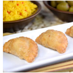
ROPA VIEJA EMPANADA

Chorizo Sausage, Peppers and Manchego Cheese wrapped in flaky Dough