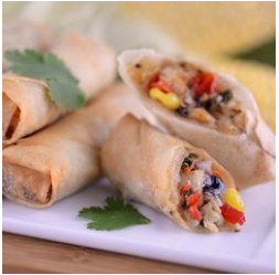
SOUTHWEST STYLE SPRING ROLL WITH CHICKEN

Seasoned Ground Beef and Cheddar Cheese wrapped in flaky Dough