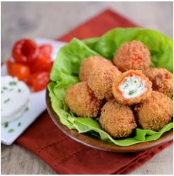
STUFFED PEPPADEW PEPPERS

Hand-Cut Chicken Tenders dipped in Coconut Batter and coated with shaved Coconut