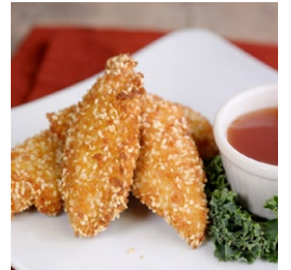
SESAME CHICKEN TENDER

Hand-Breaded Artichoke stuffed with Boursin Cheese