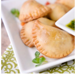
BUFFALO CHICKEN EMPANADA

Special Order items available within 3-5 days