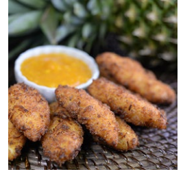
COCONUT CHICKEN TENDER

Sautéed Chicken, Peppers, Onions, Garlic, and Lime-Chipotle Crème stuffed in a Tortilla Cornucopia