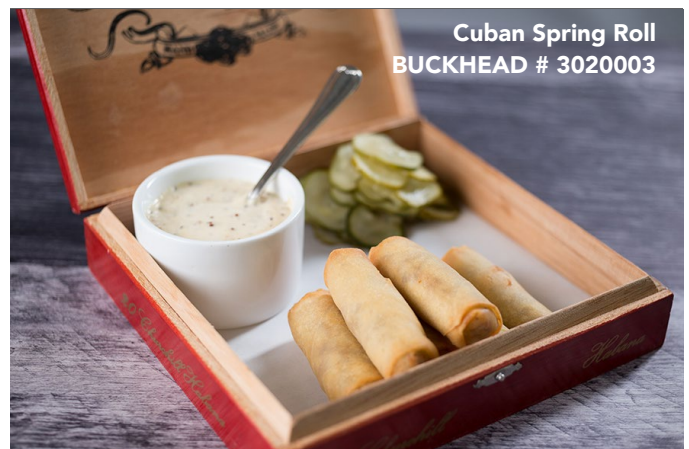
Cuban Spring Roll BUCKHEAD # 3020003