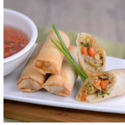
VEGETABLE SPRING ROLL

Hand-Breaded Peppadew Peppers stuffed with Goat Cheese and Herbs