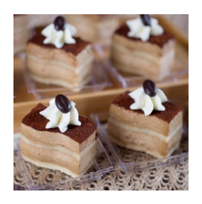
TIRAMISU MINI WAVE