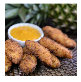
COCONUT CHICKEN TENDER

Roasted Pork, Ham, Swiss Cheese, Dill Pickles and Mustard Sauce wrapped in a Spring Roll Skin