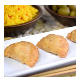
ROPA VIEJA EMPANADA

Chorizo Sausage, Peppers and Manchego Cheese wrapped in flaky Dough