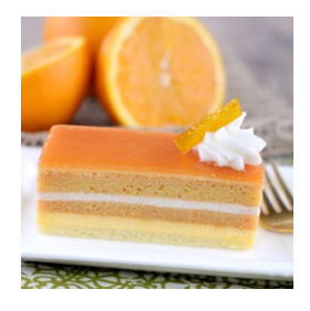
BLOOD ORANGE VALENCIA SUPC # 3955370 CASE COUNT: 36

Dark Chocolate Brownie Cake layered with White Chocolate Ganache, Dark Chocolate Truffle Ganache, and Chocolate Diplomat Cream, topped with Dark Chocolate Glaze