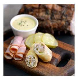
CUBAN SPRING ROLL

Chicken Breast, Sliced Ham and Swiss Cheese wrapped in flaky Puff Pastry