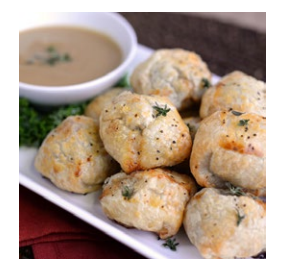
BEEF WITH MUSHROOM IN PUFF PASTRY

Seasoned Ground Beef and Blue Cheese wrapped in flaky Dough