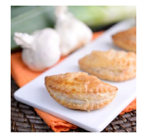
CHICKEN & LEEK IN PUFF PASTRY

Seasoned Ground Beef and Blue Cheese wrapped with Applewood Smoked Bacon