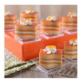
BLOOD ORANGE VALENCIA MINI WAVE

Alternating layers of Almond Mascarpone Mousse, Raspberry White Chocolate Mousse, and Almond Sponge Cake, topped with a fine layer of Seeded Raspberry Preserves