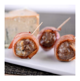
BLUE CHEESE MEATBALL