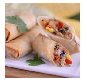
SOUTHWEST STYLE SPRING ROLL WITH CHICKEN

Seasoned Ground Beef and Cheddar Cheese wrapped in flaky Dough