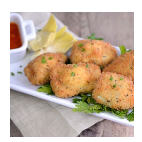
BOURSIN STUFFED ARTICHOKE SUPC # 3947458 CASE COUNT: 100

Mushroom Duxelles and Smoked Mozzarella on a Puff Pastry round