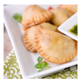
BUFFALO CHICKEN EMPANADA