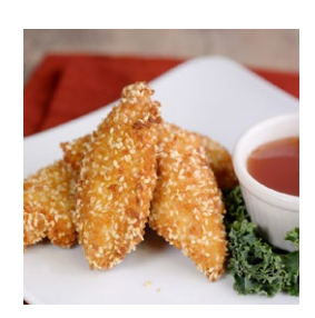
SESAME CHICKEN TENDER

Hand-Breaded Artichoke stuffed with Boursin Cheese