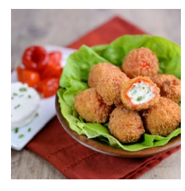
STUFFED PEPPADEW PEPPERS

Smoked Chicken, Braised Leek, Garlic and Herb Boursin Cheese wrapped in flaky Puff Pastry