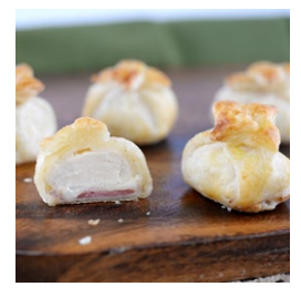
CHICKEN, HAM & CHEESE IN PUFF PASTRY

Sautéed Chicken, Peppers, Onions, Garlic, and Lime-Chipotle Créme stuffed in a Tortilla Cornucopia