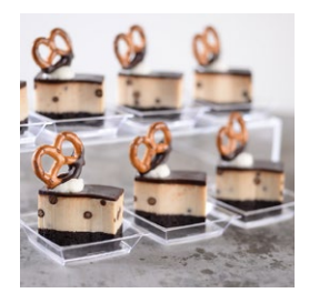
CHOCOLATE PEANUT BUTTER PRETZEL MINI WAVE

Alternating layers of Orange Mascarpone Mousse and Almond Sponge Cake brushed with Blood Orange Syrup, White Chocolate Mousse, topped with Blood Orange Glaze