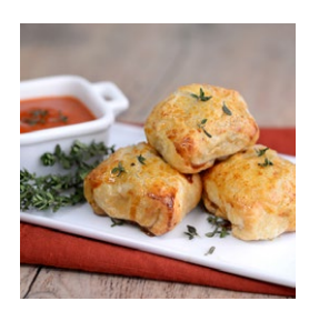
CHICKEN STUFFED WITH MUSHROOM