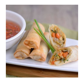
VEGETABLE SPRING ROLL

Sautéed Peppers, Onions, Garlic, Herbs and a blend of Shredded Cheeses stuffed in a Tortilla Cornucopia