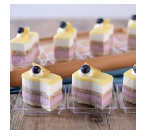
LEMON BLUEBERRY MINI WAVE

Dark Chocolate Brownie Cake lavered with White Chocolate Ganache, Dark Chocolate Truffle Ganache, and Chocolate Diplomat Cream, topped with Dark Chocolate Glaze