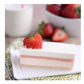
STRAWBERRY SHORTCAKE BUCKHEAD # CASE COUNT: 36

Alternating layers of Almond Sponge Cake brushed with Espresso Coffee Syrup, Coffee Buttercream and Dark Chocolate Ganache, topped with Dark Chocolate Glaze