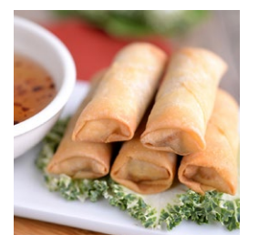
CHICKEN CASHEW SPRING ROLL

Chicken, Peppers, Black Beans, Sautéed Corn and Spices wrapped in a Spring Roll Skin