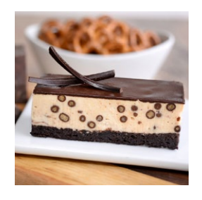
CHOCOLATE PEANUT BUTTER PRETZEL

Dark Chocolate Brownie Cake layered with White Chocolate Ganache, Dark Chocolate Truffle Ganache, and Dark Chocolate Mousse, topped with Dark Chocolate Glaze