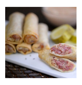
REUBEN SPRING ROLL