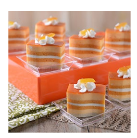
VALENCIA ORANGE MINI WAVE

Dark Chocolate Brownie Cake layered with White Chocolate Ganache, Dark Chocolate Truffle Ganache, and Dark Chocolate Mousse, topped with Dark Chocolate Glaze