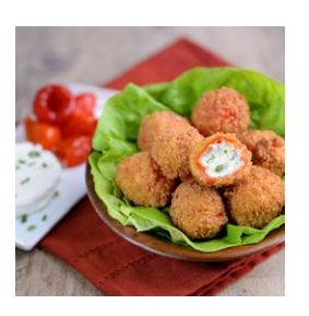
STUFFED PEPPADEW PEPPERS

Corned Beef, Swiss Cheese, Sauerkraut and House made Russian Dressing wrapped in a Spring Roll Skin