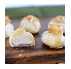
CHICKEN, HAM & CHEESE IN PUFF PASTRY

Seasoned Chicken Breast and Mushroom Duxelles wrapped in flaky Puff Pastry