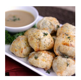
MINI BEEF WELLINGTON

Seasoned Ground Beef and Blue Cheese wrapped in flaky Dough