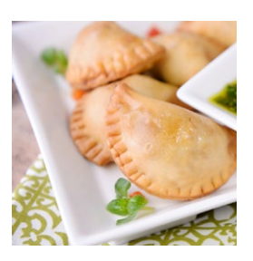
BUFFALO CHICKEN EMPANADA