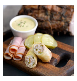
CUBAN CIGAR SPRING ROLL

Chicken Breast, Sliced Ham and Swiss Cheese wrapped in flaky Puff Pastry