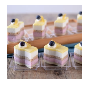
LEMON BLUEBERRY MINI WAVE

Alternating layers of Orange Mascarpone Mousse and Almond Sponge Cake brushed with Blood Orange Syrup, White Chocolate Mousse, topped with Blood Orange Glaze