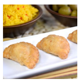
ROPA VIEJA EMPANADA

Chorizo Sausage, Peppers and Manchego Cheese wrapped in flaky Dough