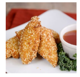
SESAME CHICKEN TENDER

Hand-Breaded Artichoke stuffed with Boursin Cheese