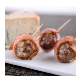
BACON WRAPPED BLUE CHEESE MEATBALL

Beef Tenderloin and Mushroom Duxelles wrapped in a flaky Puff Pastry