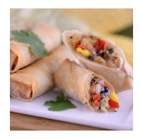
SOUTHWEST STYLE SPRING ROLL WITH CHICKEN

Seasoned Ground Beef and Cheddar Cheese wrapped in flaky Dough