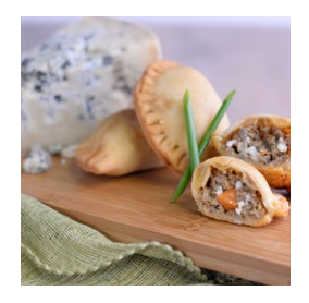
BEEF EMPANADA WITH BLUE CHEESE

Buffalo-Style Chicken, Celery, Carrots and House made Dressing wrapped in a Spring Roll Skin