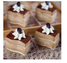
TIRAMISU MINI WAVE

Alternating layers of Strawberry Mascarpone Mousse and Almond Sponge Cake brushed with Strawberry Syrup, topped with Vanilla White Chocolate