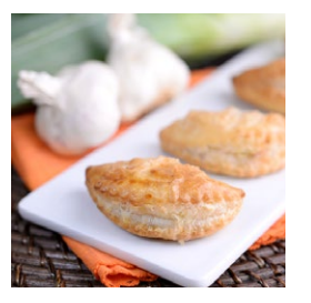
SMOKED CHICKEN & LEEK IN PUFF PASTRY

Seasoned Ground Beef and Blue Cheese wrapped with Applewood Smoked Bacon