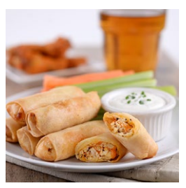
BUFFALO SPRING ROLL

Roasted Pork, Ham, Swiss Cheese, Dill Pickles and Mustard Sauce wrapped in a Spring Roll Skin