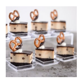
CHOCOLATE PEANUT BUTTER PRETZEL MINI WAVE BUCKHEAD # 7057008 CASE COUNT: 88

Dark Chocolate Brownie Cake layered with White Chocolate Raspberry Ganache and Dark Chocolate Mousse, topped with a Dark Chocolate Glaze