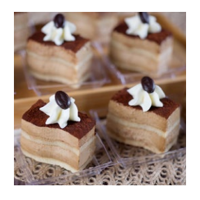
TIRAMISU MINI WAVE

On demand items are available within 48 hours BUCKHEAD Offered through Buckhead Meat of Florida