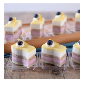
LEMON BLUEBERRY MINI WAVE

Dark Chocolate Brownie Cake layered with White Chocolate Ganache, Dark Chocolate Truffle Ganache, and Dark Chocolate Mousse, topped with Dark Chocolate Glaçage