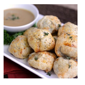
MINI BEEF WELLINGTON

Seasoned Ground Beef and Blue Cheese wrapped in flaky Dough