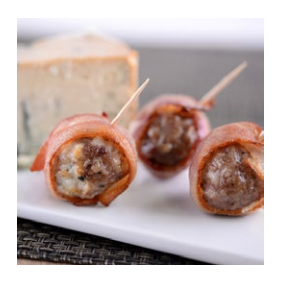
BACON WRAPPED BLUE CHEESE MEATBALL