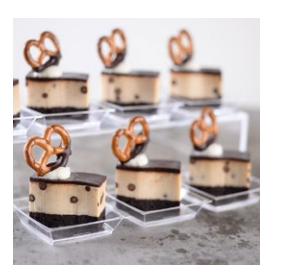
CHOCOLATE PEANUT BUTTER PRETZEL MINI WAVE

Alternating layers of Orange Mascarpone Mousse and Almond Sponge Cake brushed with Blood Orange Syrup, White Chocolate Mousse, topped with Orange Curd