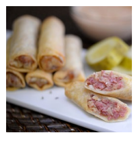
REUBEN SPRING ROLL

Hand-Breaded Artichoke stuffed with Boursin Cheese