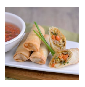
VEGETABLE SPRING ROLL