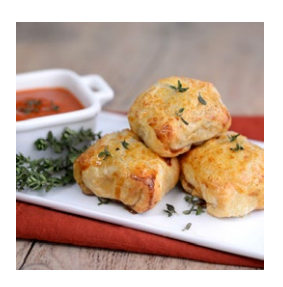
MINI CHICKEN WELLINGTON