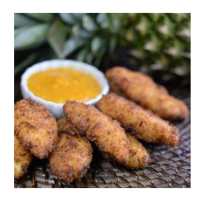
COCONUT CHICKEN TENDER

Roasted Pork, Ham, Swiss Cheese, Dill Pickles and Mustard Sauce wrapped in a Spring Roll Skin