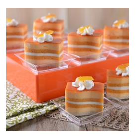
ORANGE VALENCIA MINI WAVE

Alternating layers of Almond Mascarpone Mousse, Raspberry White Chocolate Mousse, and Almond Sponge Cake, topped with a fine layer of Seeded Raspberry Preserves