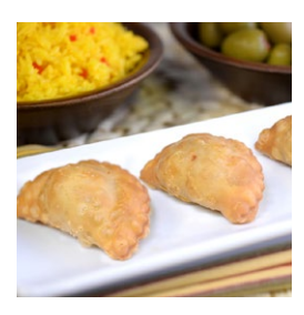
ROPA VIEJA EMPANADA

Chorizo Sausage, Peppers and Manchego Cheese wrapped in flaky Dough