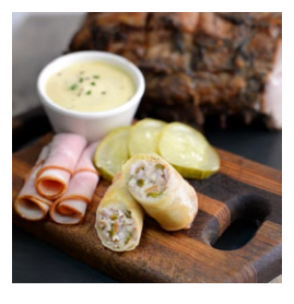
CUBAN SPRING ROLL

Chicken Breast, Sliced Ham and Swiss Cheese wrapped in flaky Puff Pastry