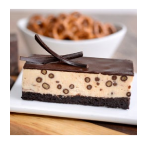
CHOCOLATE PEANUT BUTTER PRETZEL

Cherry Pistachio, Chocolate Hazelnut and Citron Financiers