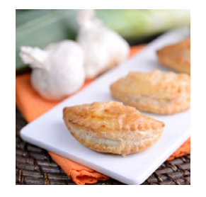
CHICKEN & LEEK IN PUFF PASTRY

Seasoned Ground Beef and Blue Cheese wrapped with Applewood Smoked Bacon