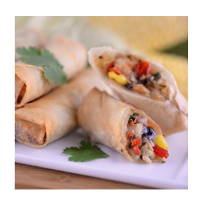
SOUTHWEST STYLE SPRING ROLL WITH CHICKEN

Seasoned Ground Beef and Cheddar Cheese wrapped in flaky Dough