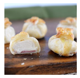
CHICKEN, HAM & CHEESE IN PUFF PASTRY

Sautéed Chicken, Peppers, Onions, Garlic, and Lime-Chipotle Créme stuffed in a Tortilla Cornucopia