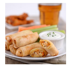
BUFFALO SPRING ROLL

Hand-Cut Chicken Tenders dipped in Coconut Batter and coated with shaved Coconut