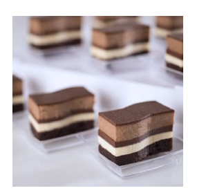
CHOCOLATE TRUFFLE MINI WAVE SUPC # 4587560 CASE COUNT: 88

Dark Chocolate Brownie Cake layered with White Chocolate Raspberry Ganache and Dark Chocolate Mousse, topped with a Dark Chocolate Glaçage