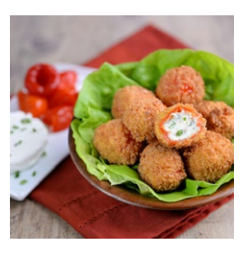
STUFFED PEPPADEW PEPPERS

A blend of Shredded Beef, Peppers, Onions and Olives wrapped in flaky Dough