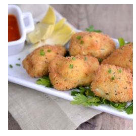
BOURSIN STUFFED ARTICHOKE

Smoked Chicken, Braised Leek, Garlic and Herb Boursin Cheese wrapped in flaky Puff Pastry